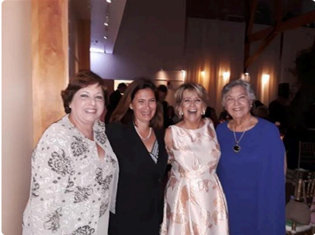
We loved that she traveled to Maryland to celebrate with us!!??